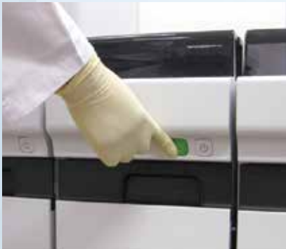
Single master switch for easy startup of the XN-9100