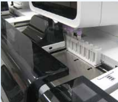
Automatic sample analysis, including reflex testing, according to LIS test orders