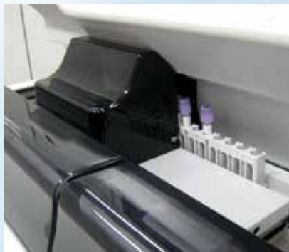
Enhanced workflow with an integrated smear preparation and cell-pre-classification unit based on user-defined rules and conditions